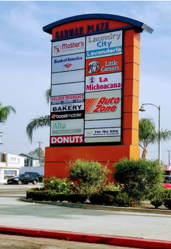
Pylon Signage Availability

UNIT 2313: 3,645 Sq. Ft. Large Open Space Large Open Space and Restrooms.