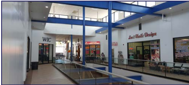
Walk-Thru Promenade Retail Shops