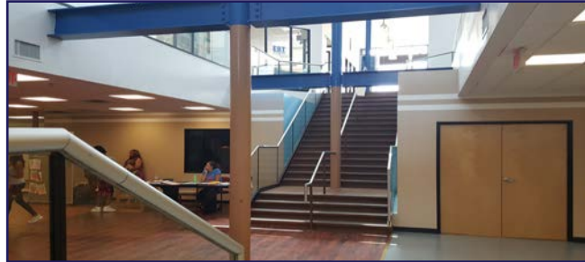
Open Atrium Design to Lower Level 2 Stair Wells & 9 Passenger Elevator