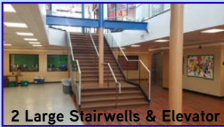
2 Large Stairwells & Elevator