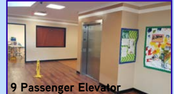
9 Passenger Elevator