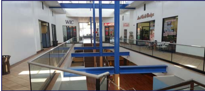
Interior Promenade Walkway & Shops