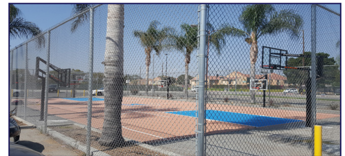
Outdoor Fenced-in Jr. Basketball Court & Exercise Area