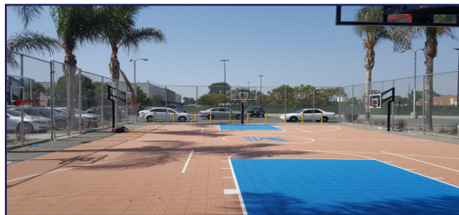
Outdoor Fenced-in Jr. Basketball Court Exercise Area