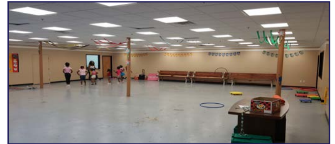
Community Center \ Open Recreation Area