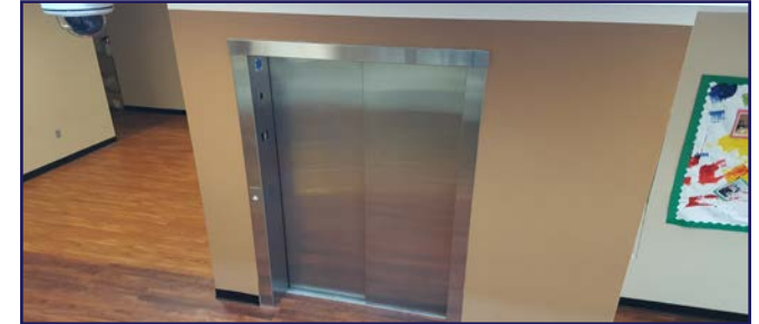
9 Passenger Elevator & Freight Service for Lower Level