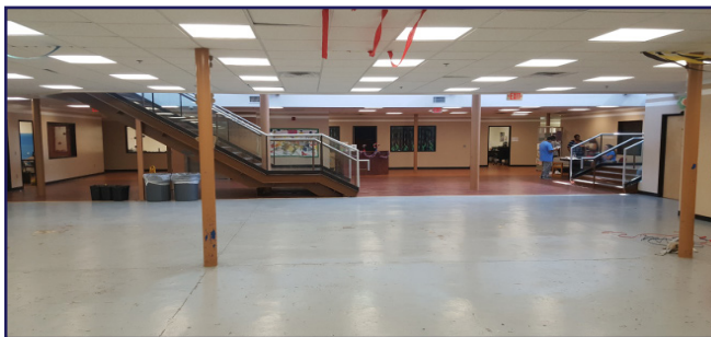
Open Floor Area with 7 Perimeter Classrooms & 3 Private Offices