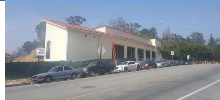
E. HUNTINGTON DRIVE SOUTH ELEVATION