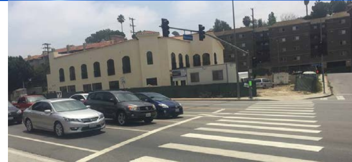
E. HUNTINGTON DRIVE NORTH ELEVATION