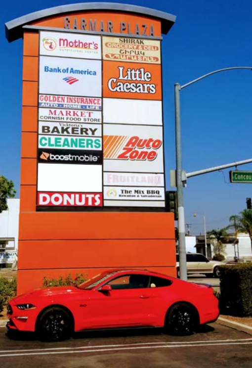
Pylon Signage Availability