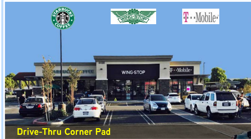
Drive-Thru Corner Pad