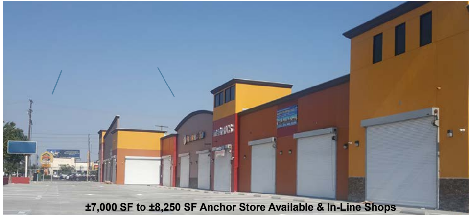
±7,000 SF to ±8,250 SF Anchor Store Available & In-Line Shops