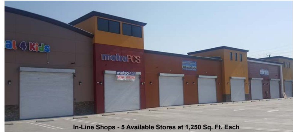
In-Line Shops - 5 Available Stores at 1,250 Sq. Ft. Each