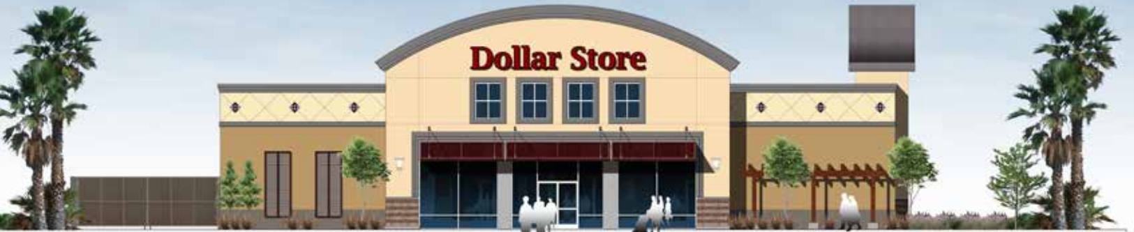
Major A - Anchor Store Elevation Facing Parking Lot