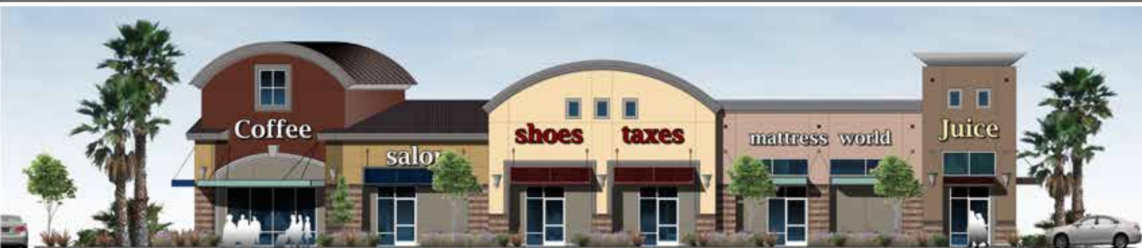
Corner Pad A - In-Line Stores Facing Foothill Boulevard