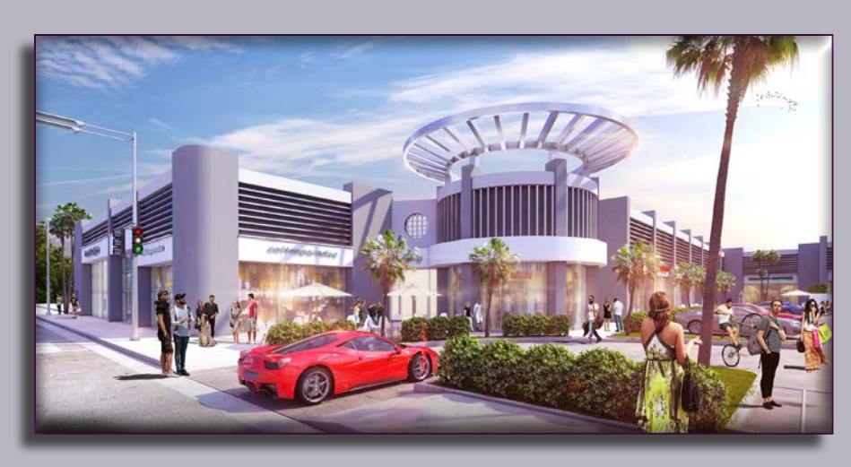
ALAMEDA STREET ENDCAP