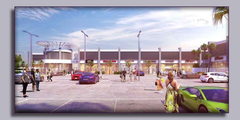
IN-LINE STORE FRONTS & PARKING AREA