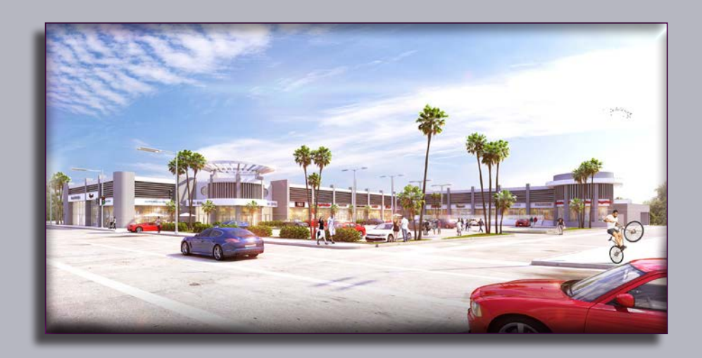
FULL CENTER VIEW